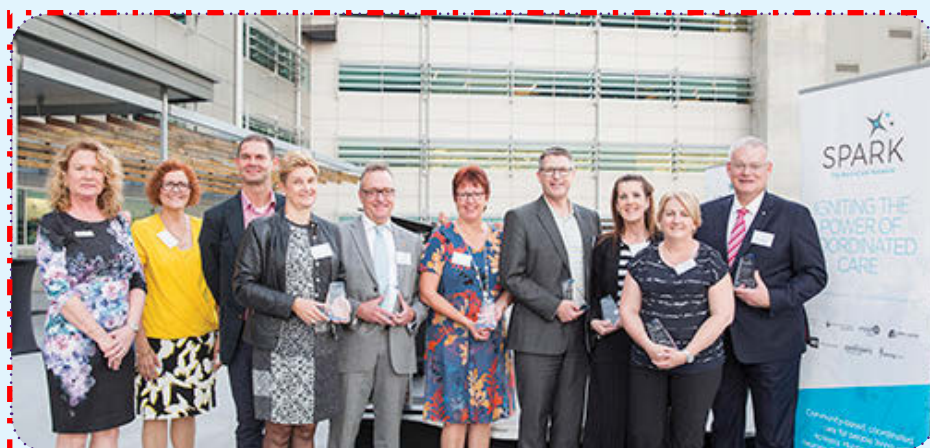
● Spark Launch Partner Organisation Reps and Minister O'Rourke

To get in touch with Spark NeuroCare either contact Epilepsy Queensland on 07 3435 5000 or call them direct on 07 4412 7700.